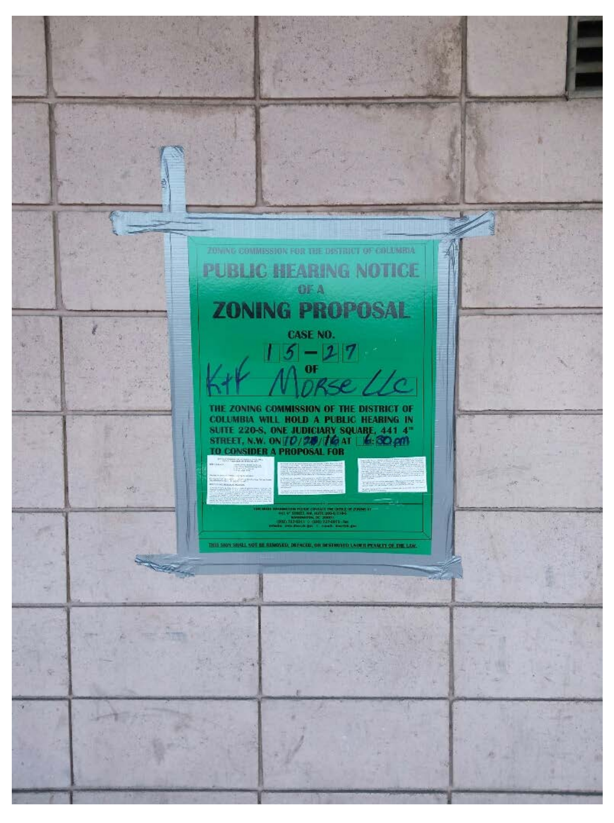
2. ZC 15-27